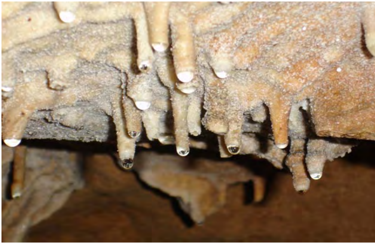
Soda straws at the Florida Caverns

Petroleum Geologists (AAPG) and the Gulf Coast Association of Geological Societies (GCAGS), by submitting the required mid-year and annual reports, and sending delegates to the national meetings.