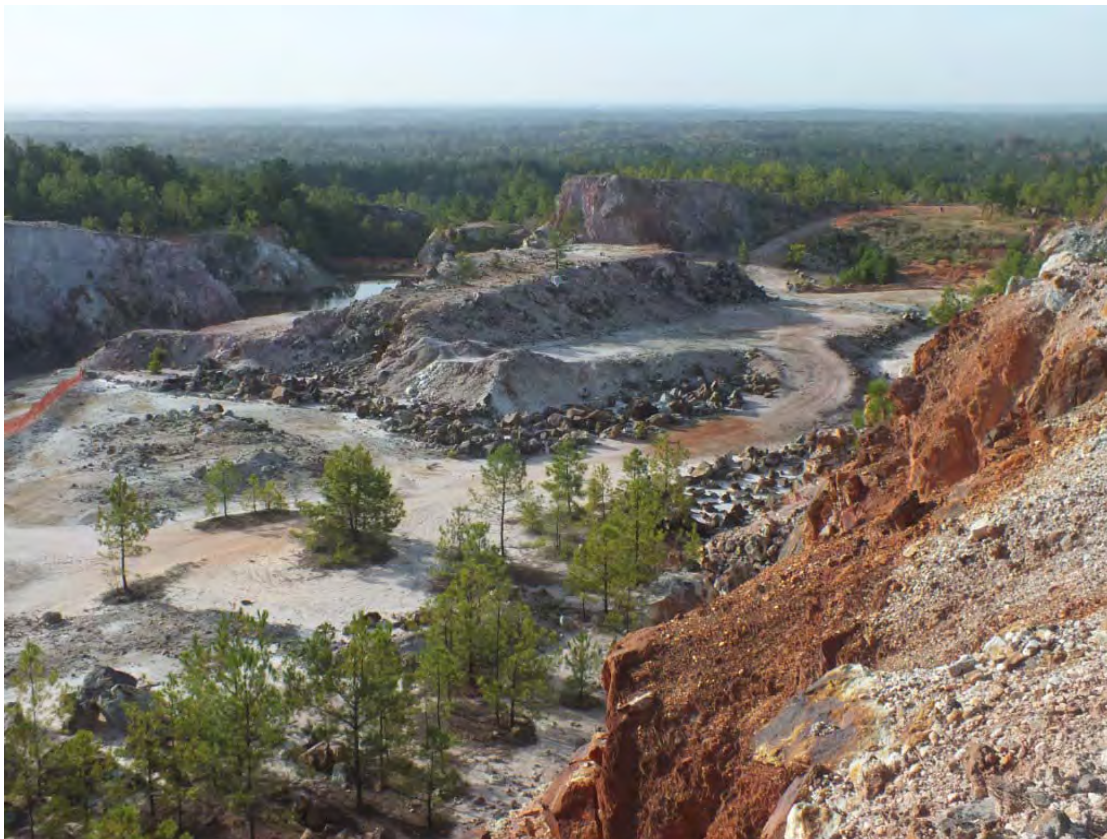
The West Pit at Graves Mountain

Graves Mountain is a quartz-kyanite monadnock that contains a variety of oxide and phosphate trace mineralization. Rutile, limonite, lazulite, kyanite, and quartz specimens are prized by collectors. The deposit was first mined by the famous Tiffany jewelers, who recovered large rutile crystals that they used to make costume jewelry. More recently, and more extensively, it was mined for kyanite (a refractory material) and byproduct pyrite, a source of sulfur.