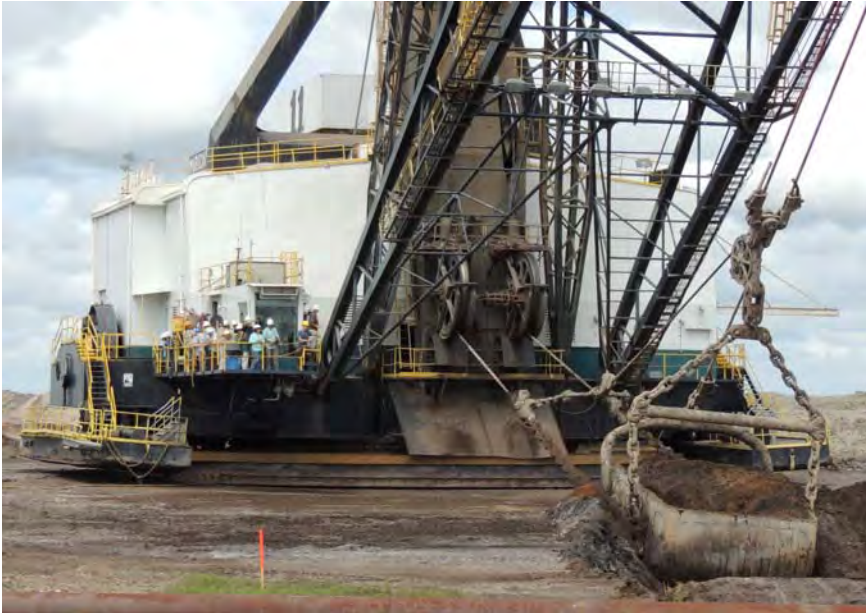
SEGS Group riding a dragline at MOSAIC's South Fort Meade Mine