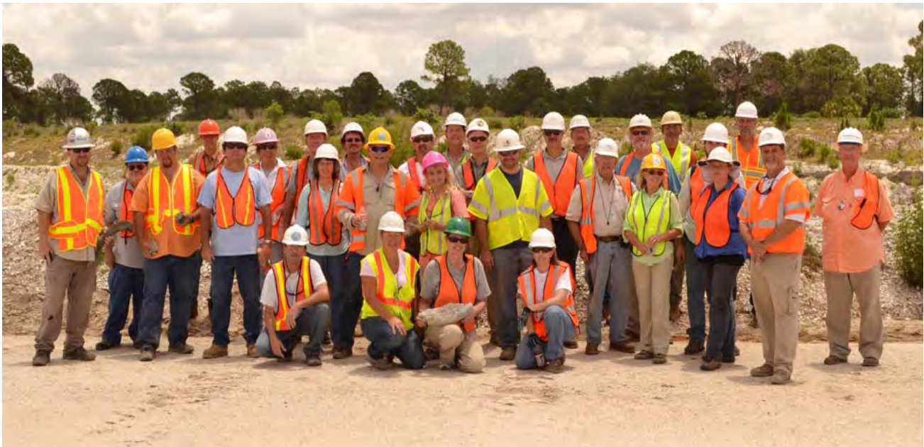
SEGS Group photo at SMR Aggregates in May, 2012