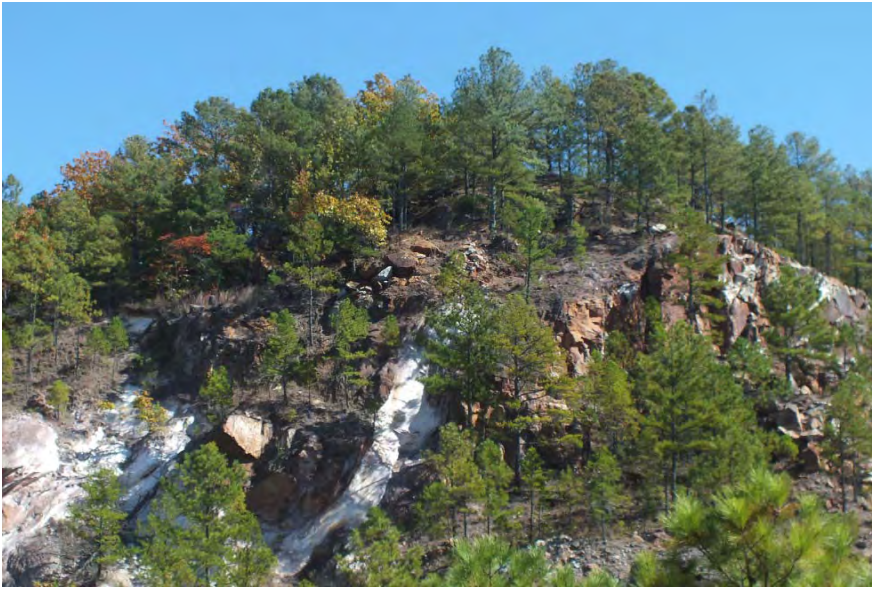
Fall foliage at Graves Mountain